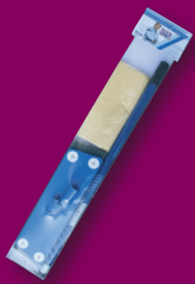
Floorservice® Dry Cleaning Set