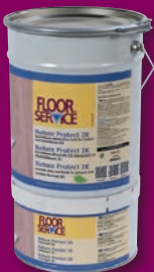
Floorservice® Nature Protect 2K

Invisible ultra matte finish for parquet and wooden floorings. Usage: approximately 2,5 litres lacquer per 10 m 2 , in 2 or 3 layers.