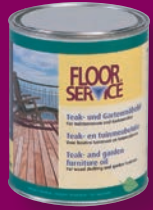
Floorservice® Teak- and garden furniture oil