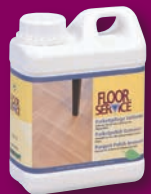
Floorservice® Parquet Polish Remover