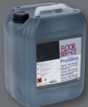
Floorservice® Prime Old Black