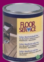
Floorservice® Color Hardwax-oil Pro

Floorservice® Hardwax-oil Pro is especially developed for professional use and is available in a wide range of 31 colours.