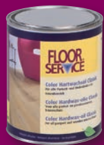
Floorservice® Color Hardwax-oil Classic.

Floorservice® Hardwax-oil Classic is available in the following 30 colours. A wide range of colours, from modern to classic, something for everyone's taste.