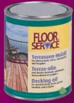
Floorservice® Decking oil