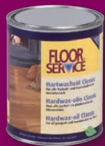
Floorservice® Hardwax-oil Classic.