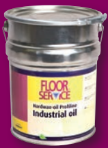
Floorservice® Hardwax-oil Profiline

Floorservice® Hardwax-oil Pro and Profiline stands for a 100% ecological product! During production of our Hardwax-oils, no chemical component is added and the full vegetable base of this product consists of renewable resources. Naturally this product meets the health regulations for the user of the Hardwax-oil and end-user of the finished product.