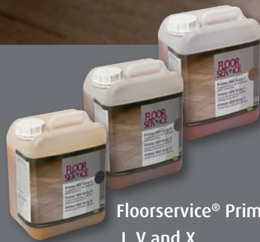
Floorservice® Prime Old Grey I, V and X

Prime Old Black creates a black coloration of the oak. Both products need to be finished with one of the Floorservice Hardwax-oil colours.