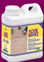
Floorservice® Nature Care

Invisible ultra matte finish for parquet and wooden floorings. Usage: approximately 2,5 litres lacquer per 10 m 2 , in 2 or 3 layers.