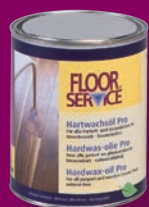
Floorservice® Hardwax-oil Pro