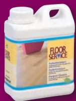
Floorservice® Parquet Cleaner